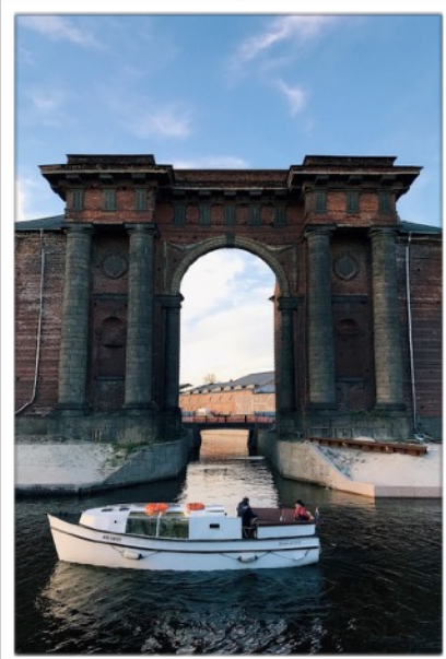
New Holland Island