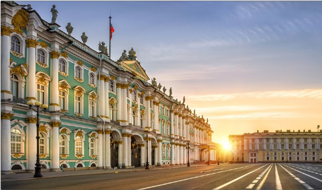
The State Hermitage Museum

Supported by Aalto University (Finland, Helsinki)