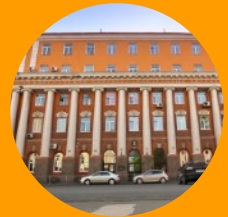
Pulkovo Airport Saint-Petersburg

St.Petersburg State Marine Technical University